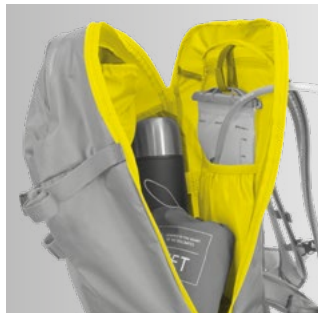
3 MULTIFUNCTIONAL STORAGE SYSTEM

Immediate access to safety equipment, gear and accessories, thanks to the wide opening and to the functional compartments, engineered to keep everything ordered and at hand.