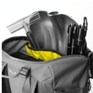
1 COMPARTMENT FOR SHOVEL AND PROBE