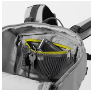
2 INNER POCKET FOR VALUES